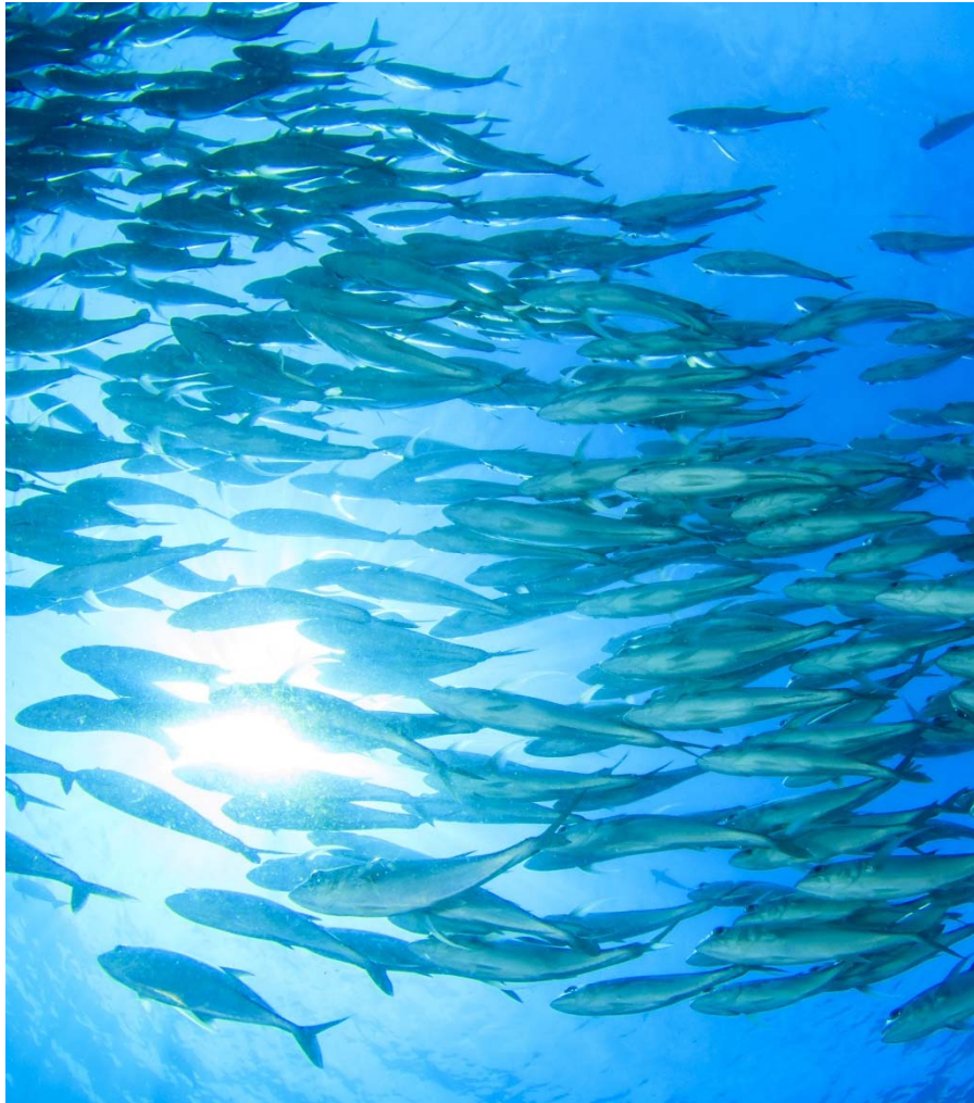
Image 2 – School of fish. Biosecurity is critical to WA’s aquatic environments and fishing/pearling/aquaculture industries