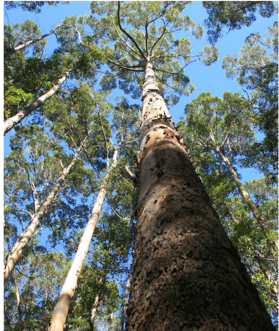
Image 3 – Biosecurity is critical to WA’s terrestrial environments and forestry industries